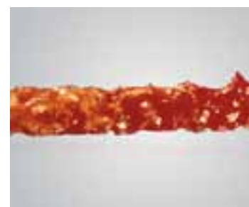
The original Jamshidi™ needle retrieves high-quality samples.