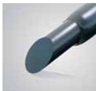
The razor-sharp cutting edge allows for easy coring of the bone.

Needles are packaged sterile with a probe and probe guide. 10 needles per case.