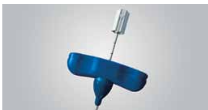
The Jamshidi™ marrow acquisition cradle fits inside the T-handle Jamshidi needle to capture and retrieve quality samples.