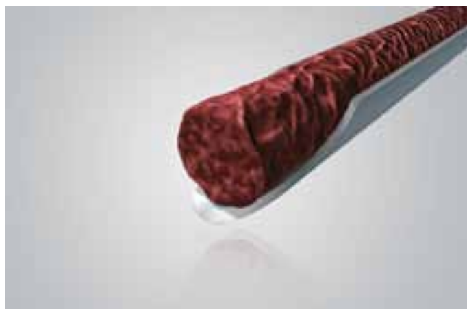
The Jamshidi™ marrow acquisition cradle is designed to provide reliable specimen retention.