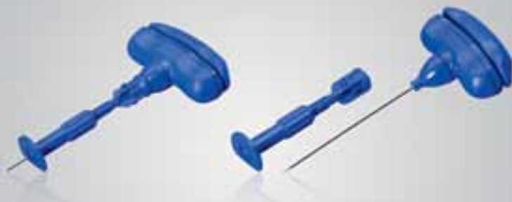
T-handle Illinois aspiration needle and removable depth stop.

The T-handle Illinois aspiration needle features an adjustable depth stop from 1" to 3¼" (26 mm to 79 mm) for sternal or pediatric application. For iliac crest use, simply remove the depth stop to expose the 79 mm aspiration cannula.