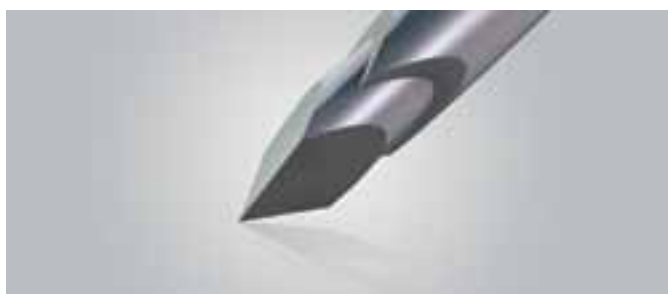
The triple crown cannula tip creates a super-sharp cutting edge.